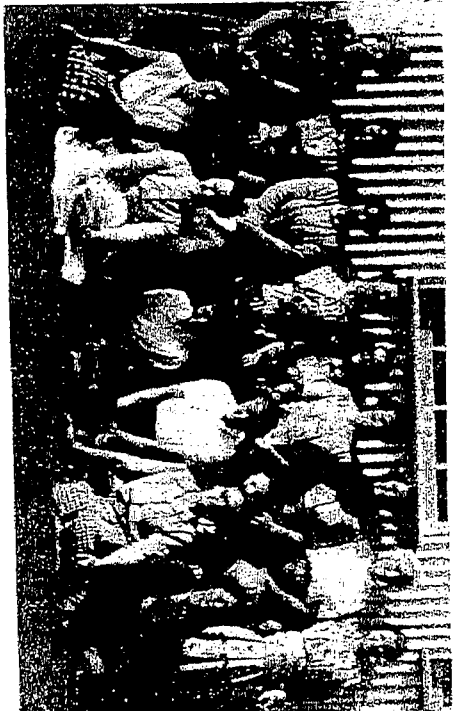
DRUMMOND LADIES GOLF CLUB Opening Day — March 1953