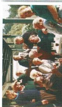
Finished fishing and celebrating on the balcony of the BOI Sword Fish Club.