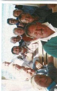
On the ferry between Russell & Paihia.