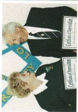
Presentation of plaques as an appreciation for the running of the Rodney Lodge Charity Golf Tournaments for the past 30 years.