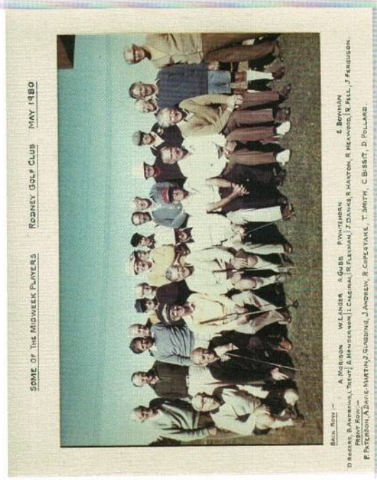
Rodney Golf Club 1980 - some of the midweek players.

The Club's name officially changed from Rodney to Warkworth Golf Club in 1982. With the greatly enlarged boundaries of the present Rodney County , and so many organisations and businesses hearing the name "Rodney", members felt Warkworth would be more explicit and identifiable.