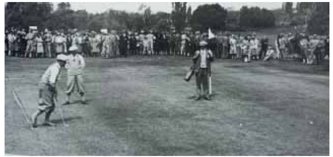
1931 New Zealand Championship

Duncan had first won the amateur title in 1899 and ten times subsequently. The Governor-General Lord Bledisloe presented the prizes. In subsequent remarks Duncan said that the condition of the course had been perfect and certainly better than any other championship he had played in.