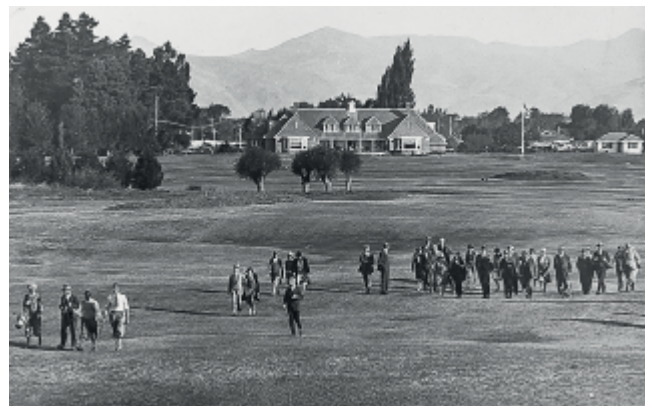
Clubhouse and Pro Shop 1927

The architects were Helmore and Cotterill who designed numerous elegant large houses in Christchurch and