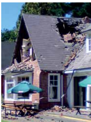
2011 Earthquake damage on Clubhouse