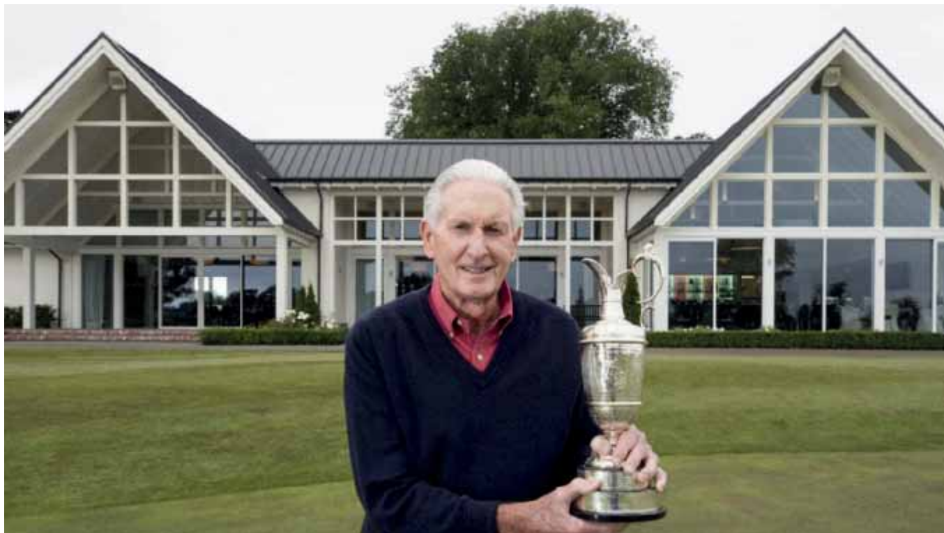
Sir Bob Charles with the claret jug in front of the new clubhouse built after the Christchurch earthquakes.