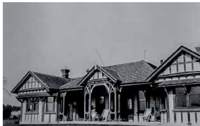
First Clubhouse at Shirley. The photo was taken in 1915