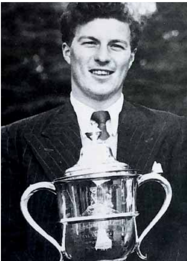
1950 Peter Thomson Winner of New Zealand Open

The championships commenced on 10 October 1950. Peter Thomson led from the first round with a 70 in a strong southerly, followed by a 69 in the second round. He faltered in the first nine of the third round going out in 39 but recovered with a second nine of 32. His final total of 280 gave him victory by 9 strokes. He had a double bogey 7 at Pagoda (then the 16th) but completed his round with a classic birdie at the last.