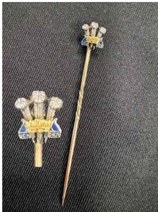
Tie pin incorporating the Prince of Wales feathers