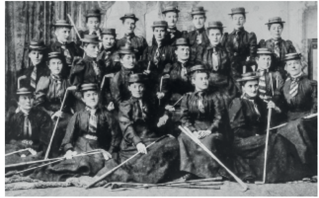
Christchurch Ladies' Golf Club 1893