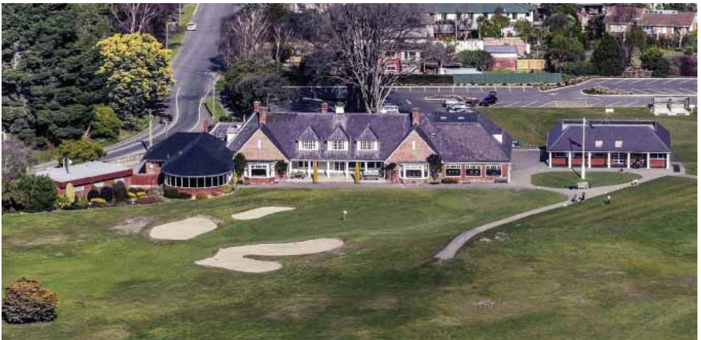
2002 Clubhouse and environs prior to the earthquakes