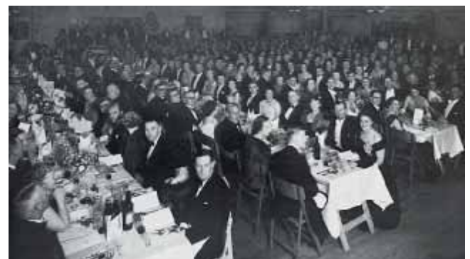
50th Anniversary Dinner of the first game at Shirley

Not only was 1950 the hundredth anniversary of the arrival of the First Four Ships, it was also the 50th anniversary of the first game at Shirley. A dinner dance to commemorate this was held on 22 July at the Winter Gardens. Three hundred and fifty guests attended with many more joining to dance after the dinner. There were eight speeches and between them amusing topical interludes were provided. A profit of £150 was made which was spent on new crockery and cutlery.